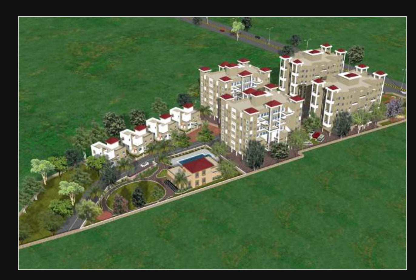
Bird's eye view of High Class Residency